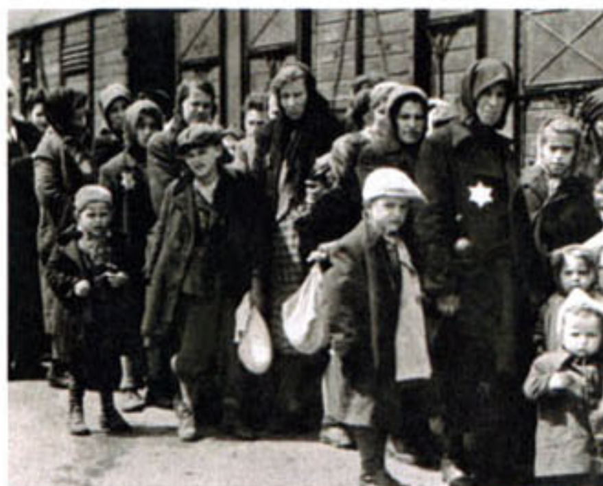
The Holocaust: Hungarian Jews arrive at Auschwitz, a concentration camp in German-occupied Poland, in June 1944.

As always, the Games started with the lighting of the Olympic Flame. And for the first time, in what has since become an Olympic tradition, the flame was lit in Olympia, Greece,