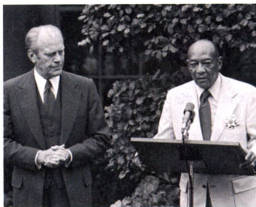
President Gerald R. Ford presented Jesse Owens with the Presidential Medal of Freedom at the White House in 1976, 40 years after his Olympic wins.

Taking place 40 years after the birth of the modern Games, the 1936 Olympics marked the first major collision of athletics