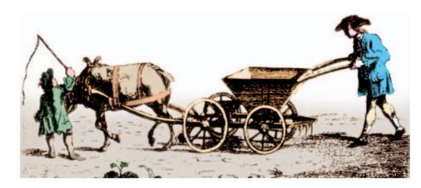
► An English farmer plants his fields in the early 1700s using a seed drill.

Rotating Crops The process of crop rotation proved to be one of the best developments by the scientific farmers. The process improved upon older methods of crop rotation, such as the medieval three-field system discussed in Chapter 14. One year, for example, a farmer might plant a field with wheat, which exhausted soil nutrients. The next year he planted a root crop, such as turnips, to restore nutrients. This might be followed in turn by barley and then clover.