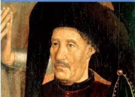
Prince Henry 1394–1460

For his role in promoting Portuguese exploration, historians call Prince Henry “the Navigator.” Although he never went on voyages of discovery, Henry was consumed by the quest to find new lands and to spread Christianity. A devout Catholic, he wanted “to make increase in the faith of our lord Jesus Christ and bring to him all the souls that should be saved.”