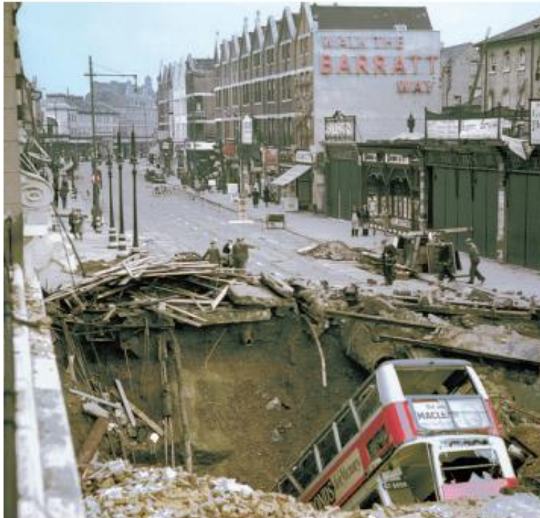
▲ A London bus is submerged in a bomb crater after a German air raid.

*** CLASS COPY – DO NOT WRITE ON THIS!***