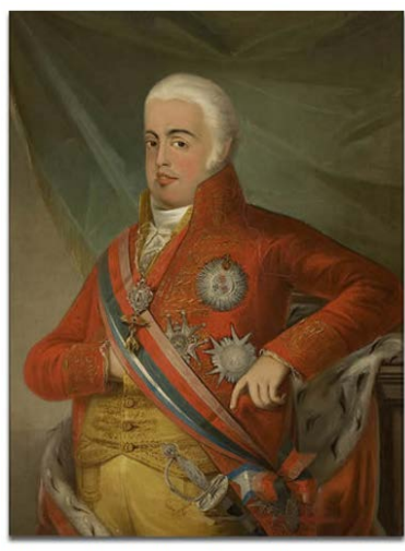
Portrait of John VI, King of Portugal hanging in São Paulo Museum of Art.

King John planned to make Brazil a colony again. However, many Brazilians could not accept a return to colonial status. In 1822, creoles demanded Brazil's independence from Portugal. Eight thousand Brazilians signed a petition asking Dom Pedro to rule. He agreed. On September 7, 1822, he officially declared Brazil's independence. Brazil had won its independence in a bloodless revolution.