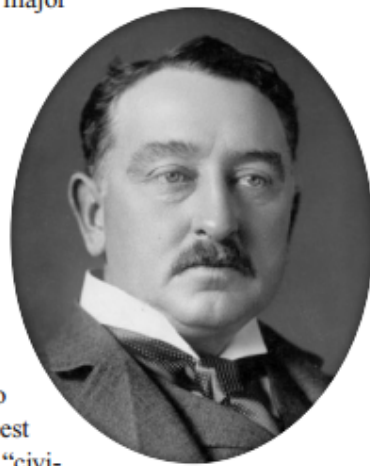
▲ Rhodes's De Beers Consolidated Mines is the biggest diamond company in the world today.

Factors Promoting Imperialism in Africa Several factors contributed to the Europeans' conquest of Africa. One overwhelming advantage was the Europeans' technological superiority. The Maxim gun, invented in 1884, was the world's first automatic machine gun. European countries quickly acquired the Maxim, while the resisting Africans were forced to rely on outdated weapons.