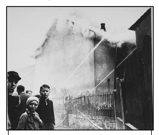
As the synagogue in Oberramstadt burns during Kristallnacht (the "Night of Broken Glass"), firefighters instead save a nearby house. Local residents watch as the synagogue is destroyed. Oberramstadt, Germany, November 9-10, 1938.

Like everyone in Germany, Jews were required to carry identity cards, but the government added special identifying marks to theirs: a red "J" stamped on them and new middle names for all those Jews who did not possess recognizably "Jewish" first names -- "Israel" for males, "Sara" for females. Such cards allowed the police to identify Jews easily.